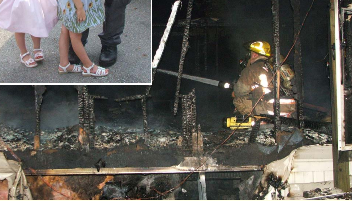
ABOVE: Jackie Patton performs overhaul following a La Crosse mobile home fire on September 11th.